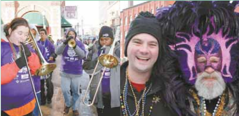
Signature Music leads the way

February 16, 2008 Armory Square, Syracuse: The beginning of a fun new tradition - the first ever world's shortest Mardi Gras Parade marched for just one block but created a big stir in Armory Square. Mardi Gras beads were $5. Condoms were free. Proceeds benefited youth prevention programs and client services at AIDS Community Resources. Thank you Magic Hat Brewing!