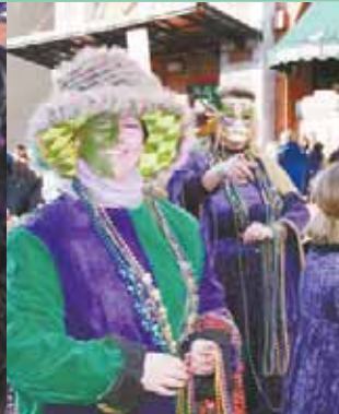
Beads for sale