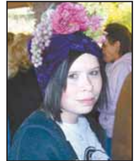
Shanara - Watertown