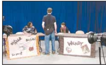
Time Warner Studio