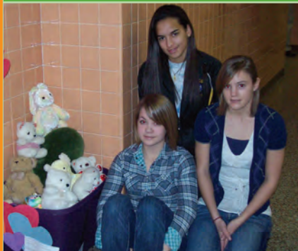
The Colton Pierrepont TATF took part in a friendly competition to see who could collect the most bears for 10th Mountain Division soldiers.

AIDS Community Resources is collecting for its April and May shipments. If you'd like to donate, contact clarge@AIDSCommunityResources.com for more information.