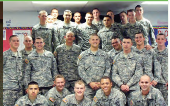
2nd Platoon, A Company, 4-31 Infantry Battalion from Fort Drum.