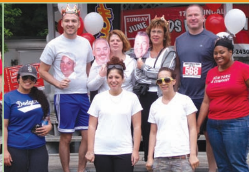
Team Stumblers held parties to raise money and came in third place overall.