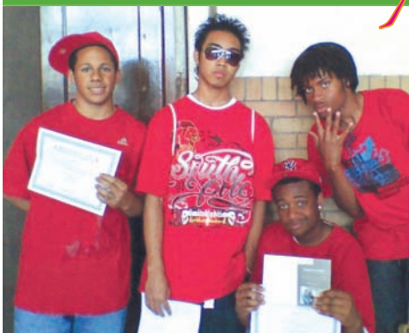
Street Movers took 3rd place in the group category.

A talent competition now in its second year, HYPE has become a very important and creative outlet for the Utica youth who want to shine; who are conscientious and involved in their community in a positive way. They all consider themselves Peer Educators because they take AIDS Community Resources' mission seriously, know how HIV/AIDS affects their peers and community, and put their talent out there to help raise community awareness.