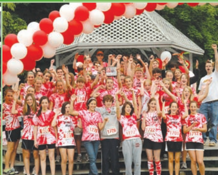
B'ville Bees, Top Teen AIDS Task Force (TATF)