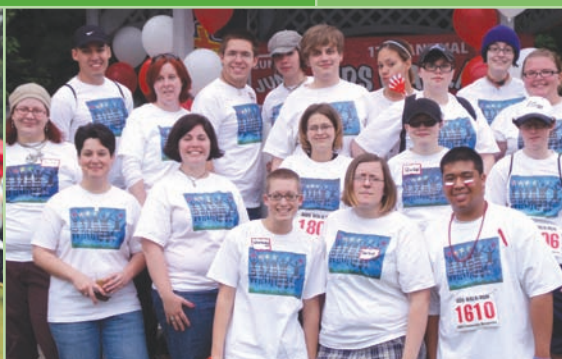
Part of the money from the AIDS Walk/Run benefits the Q Center, so Q center youth worked for their own cause.