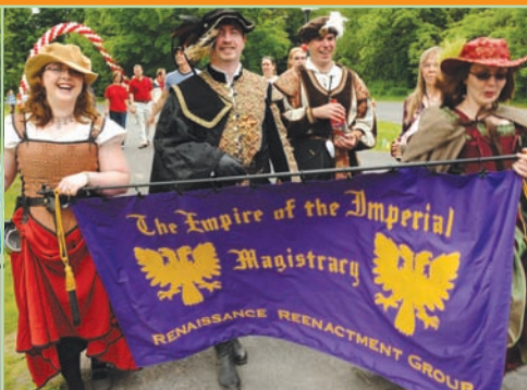
We've seen costumes over the years, but The Empire took the prize as most creative team.