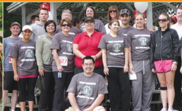
Thank you Starbucks for raising the most money ever! $22,546