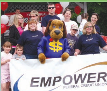
Presenting sponsor Empower Federal Credit Union with Dollar Dog front and center.