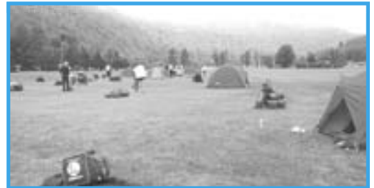
Luxurious overnight accommodations.