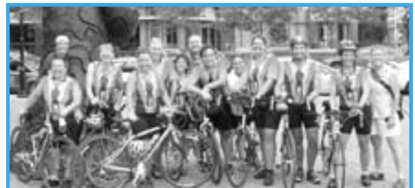
The end of the ride.