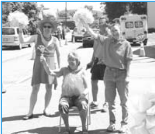
ACR's welcoming committee on day 3 of the Ride.